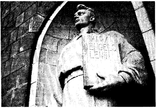
Figs. 5-6. Sala Kongresowa (Congress Hall) and Casino Queens/view and detail.

Kristevas image of the city seems to refer to the well-known urban spaces in Western Europe and the United States. But, even if we narrow the perspective down to just Europe, this picture doesnt make sense without its other, the Other Europe or the former communist countries.