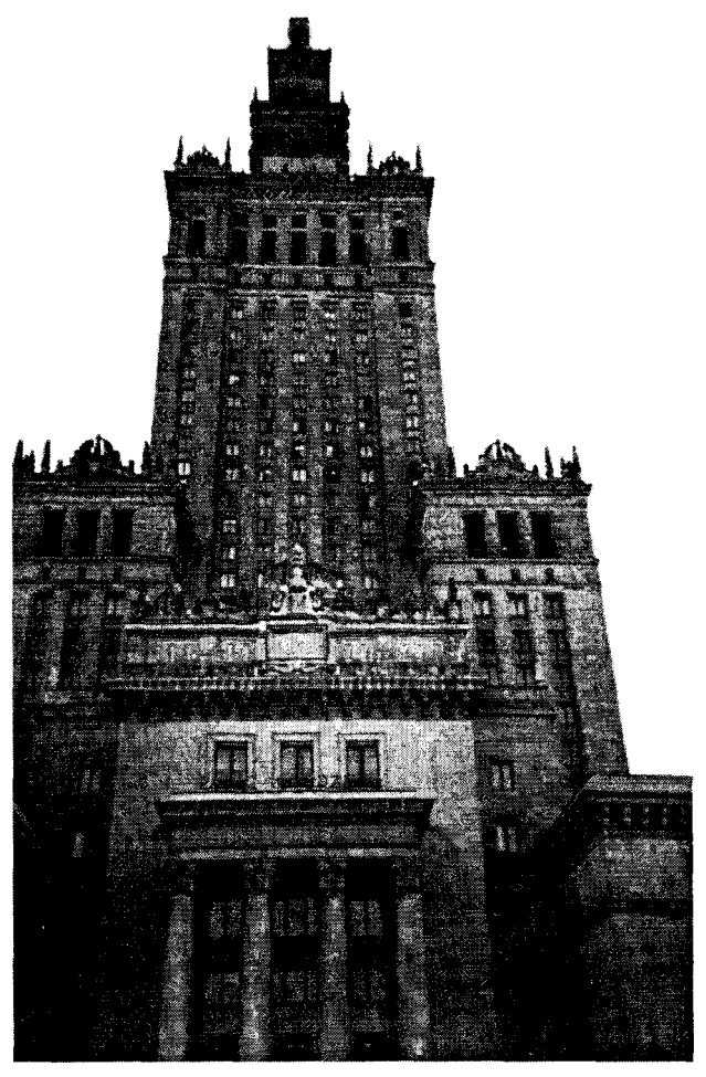
Fig. 1. Palace of Culture and Science.

The fairy-tale Palace, whose very name seems to evoke